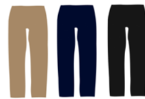
BEIGE, BLUE OR BLACK CHINOS (NO JEANS)