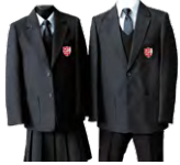
BLAZER WHITE SHIRT, TROUSERS OR SKIRT