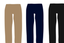
BEIGE, BLUE OR BLACK CHINOS (NO JEANS)