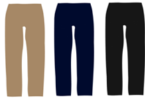
BEIGE, BLUE OR BLACK CHINOS (NO JEANS)