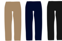
BEIGE, BLUE OR BLACK CHINOS (NO JEANS)