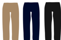
BEIGE, BLUE OR BLACK CHINOS (NO JEANS)