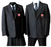
BLAZER WHITE SHIRT, TROUSERS OR SKIRT