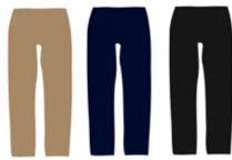
BEIGE, BLUE OR BLACK CHINOS (NO JEANS)